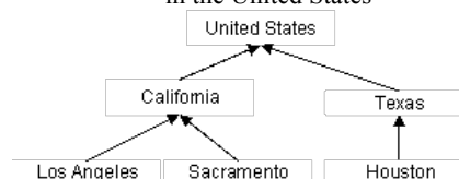
Figure 1 – An example of values for the 3 levels hierarchy in the United States