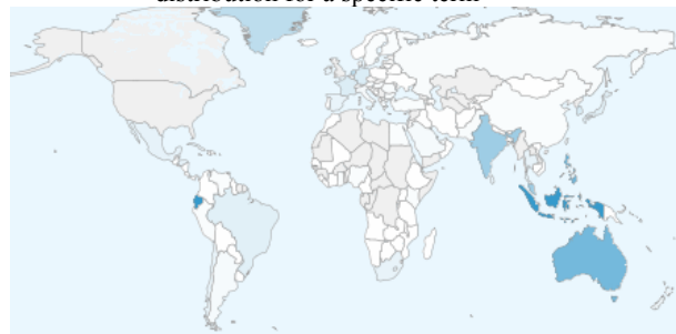
Figure 2 – An example of visualisation of the tweets distribution for a specific term