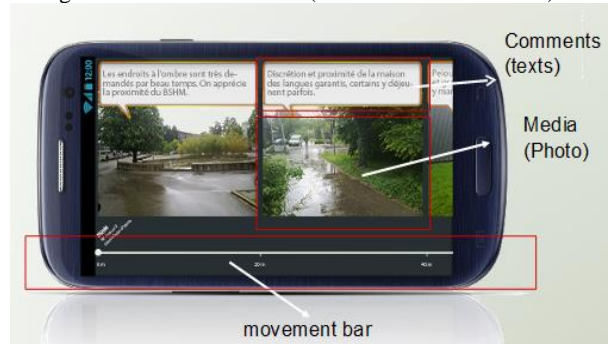
Figure 1 : Recitoire Mobile (Create a urban narrative)

« storyboard », it shows the contributions and their associated comments appearing one after the other in the chronological order on the screen using horizontal scrolling. The idea is to provide a visualization of the whole urban narrative on the screen. To contribute, the citizen chooses the media she/he wants to create (photo, video, audio). After recording, she/he is invited to comment her/his contribution in an audio or textual way.