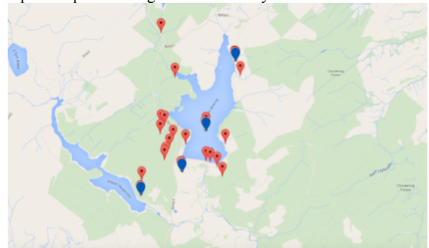
Figure 2. Posts during the event day of the WRC stage. Red markers represent posts during an event. Blue markers represent posts during an eventless day.

We manually classified the posts in order to determine that they are actually related with the event. Results show that only one post had unrelated content. We conclude that the variation in the number of posts is caused by the event.