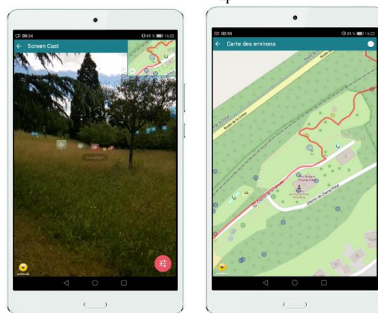
Figure 1: Screenshot of the AR mode of BioSentiers and the 2D map

The main objective of BioSentiers is to connect 9-12 y.o. pupils with the nature, and motivate them to learn about biodiversity.